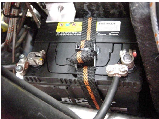
Figure 1: Standard battery (E 11)

Depending on the batteries you're using (figure 1, reference E 11, or figure 2, reference E 11 TD), you will respectively have to install straight protection (figure 3, reference E 028 D) or an angled one (figure 4, reference E 028 C).