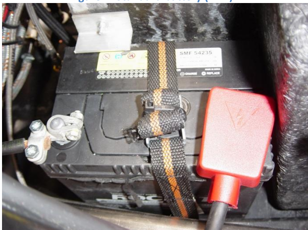
Figure 3: Straight protection for standard battery