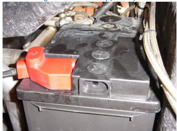
Figure 4: angled protection for « TDI » battery