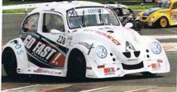
VW body covers spec tubeframed racer.